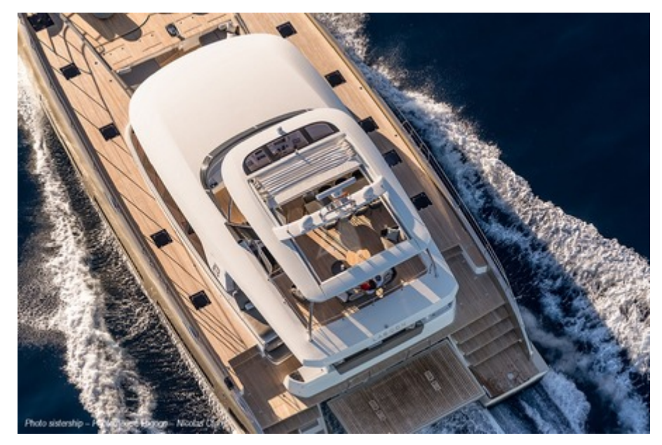
FRENCH WEST SISTERSHIP