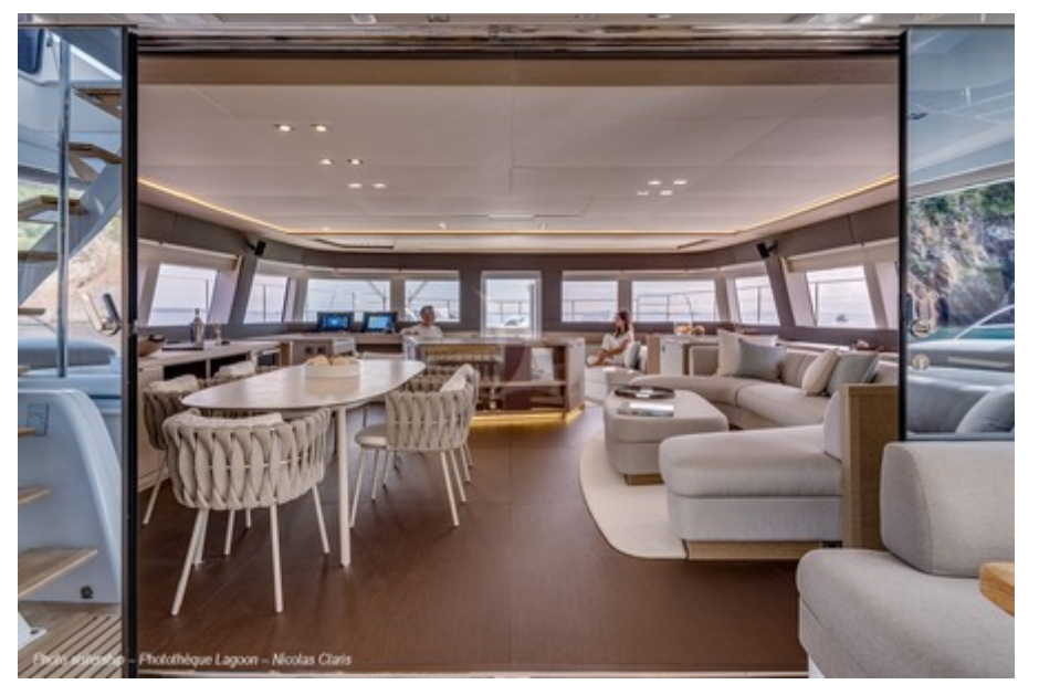
FRENCH WEST SISTERSHIP