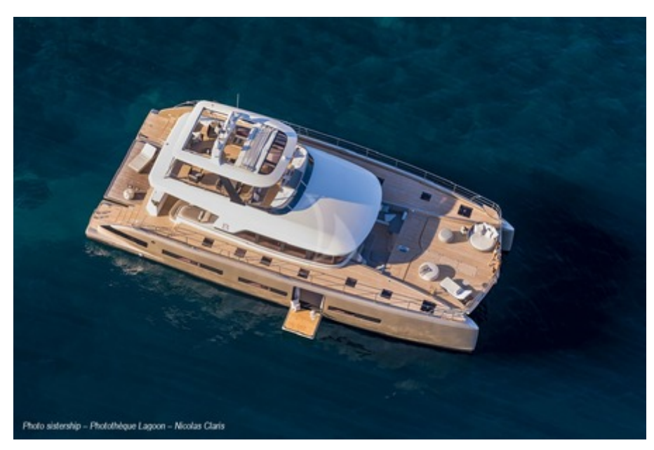
FRENCH WEST SISTERSHIP