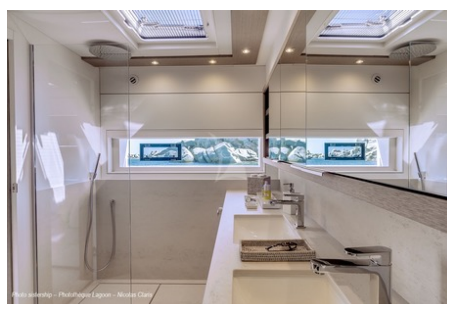
FRENCH WEST SISTERSHIP