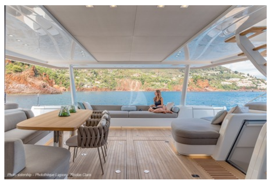
FRENCH WEST SISTERSHIP