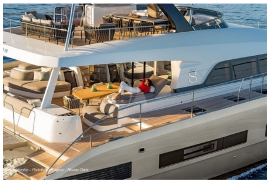
FRENCH WEST SISTERSHIP