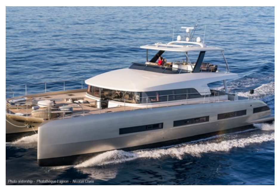
FRENCH WEST SISTERSHIP