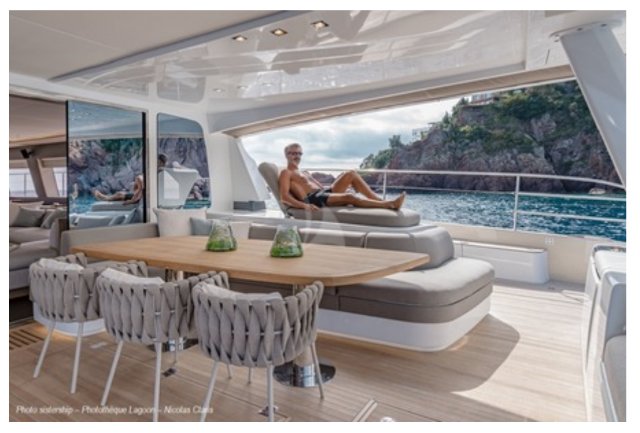
FRENCH WEST SISTERSHIP