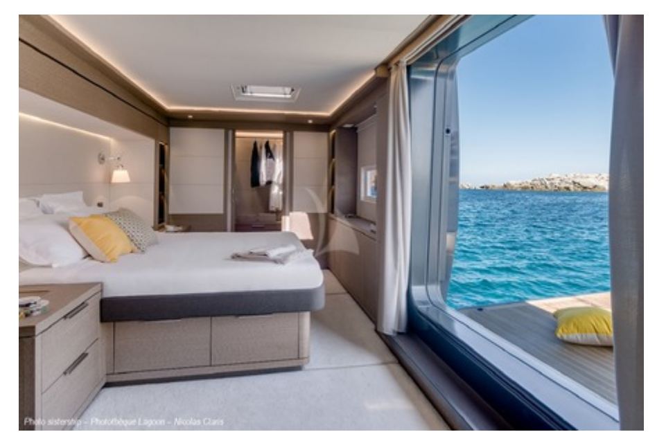
FRENCH WEST SISTERSHIP