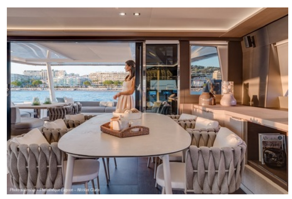
FRENCH WEST SISTERSHIP