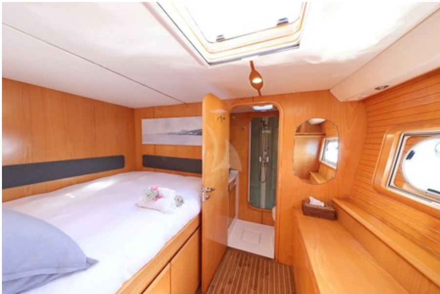
Guest cabin