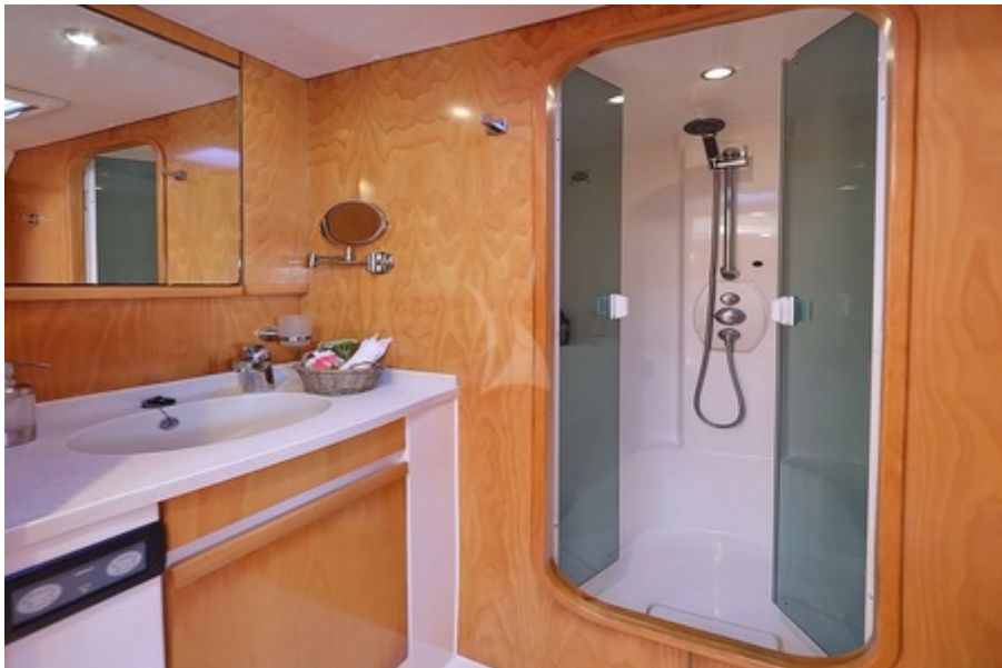
Guests bathroom