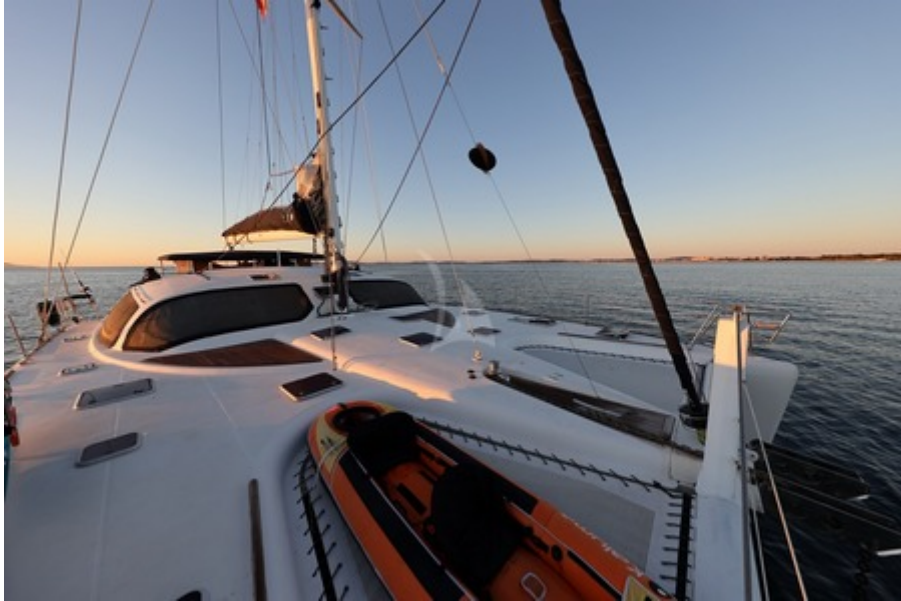
On deck