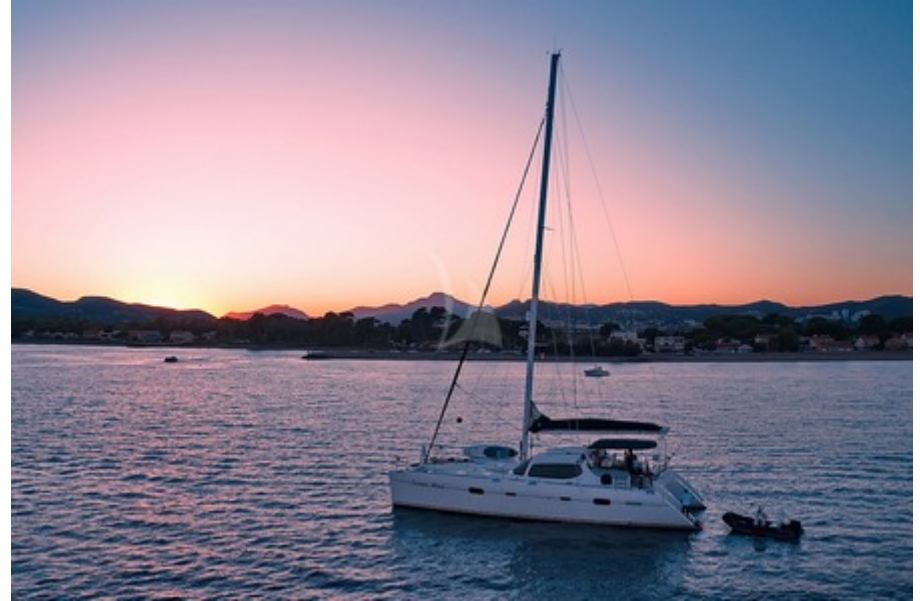
At night