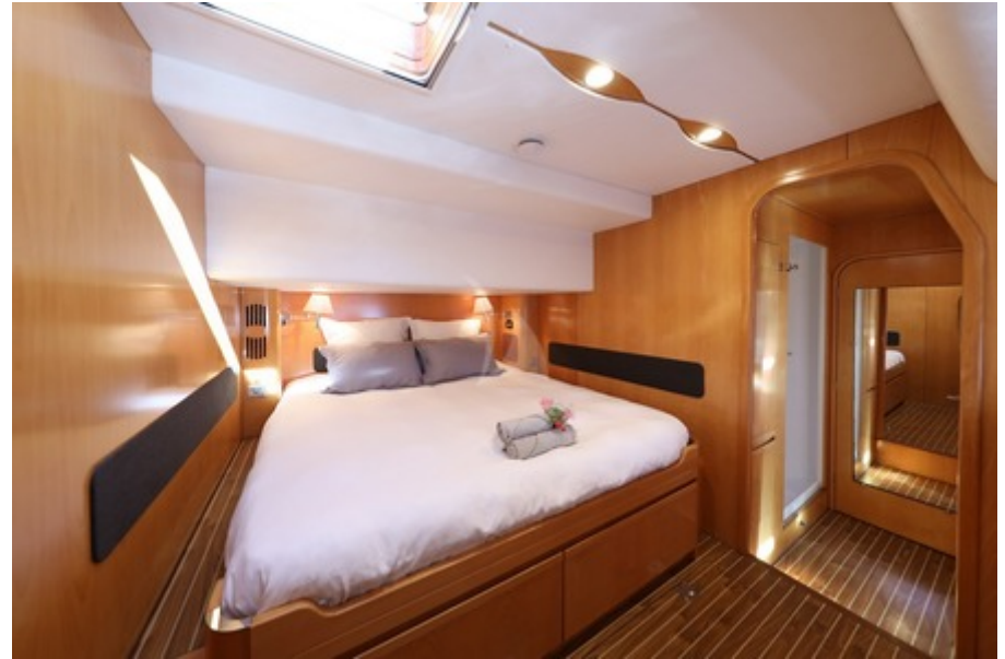
Guest cabin