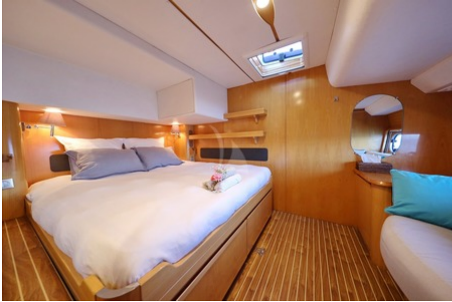
Guest cabin