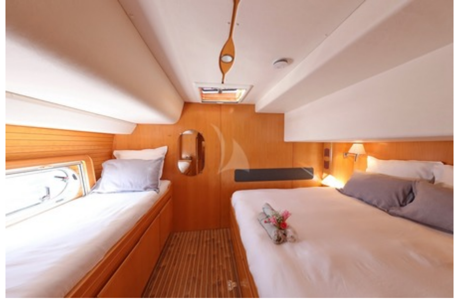
Guest cabin