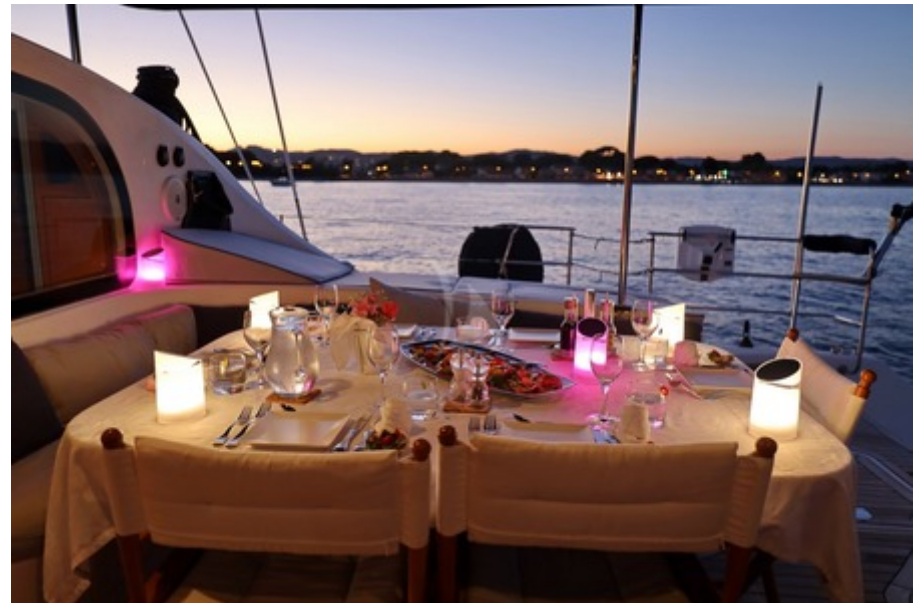
Cockpit table at night