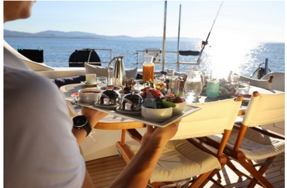
Breakfast time