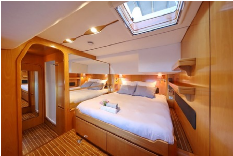
Guest cabin