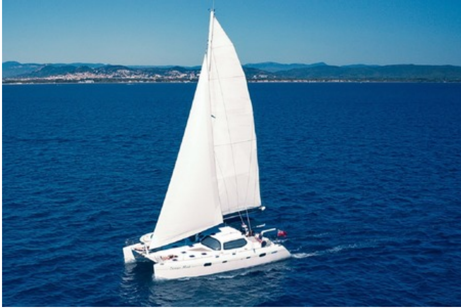
Under sail