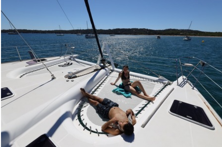
On deck