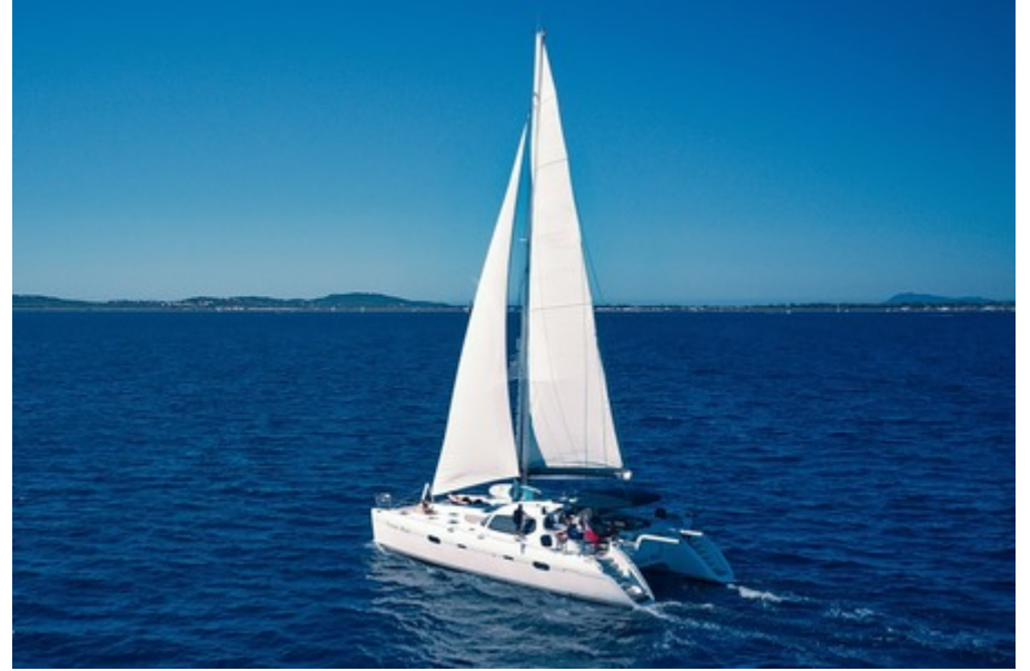
Under sail