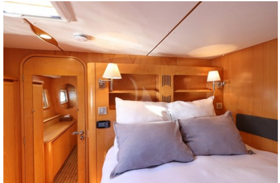
Guest cabin