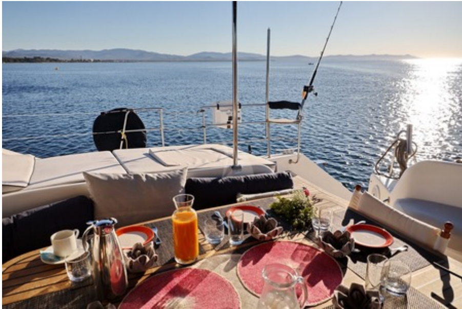
Cockpit with Sun bath