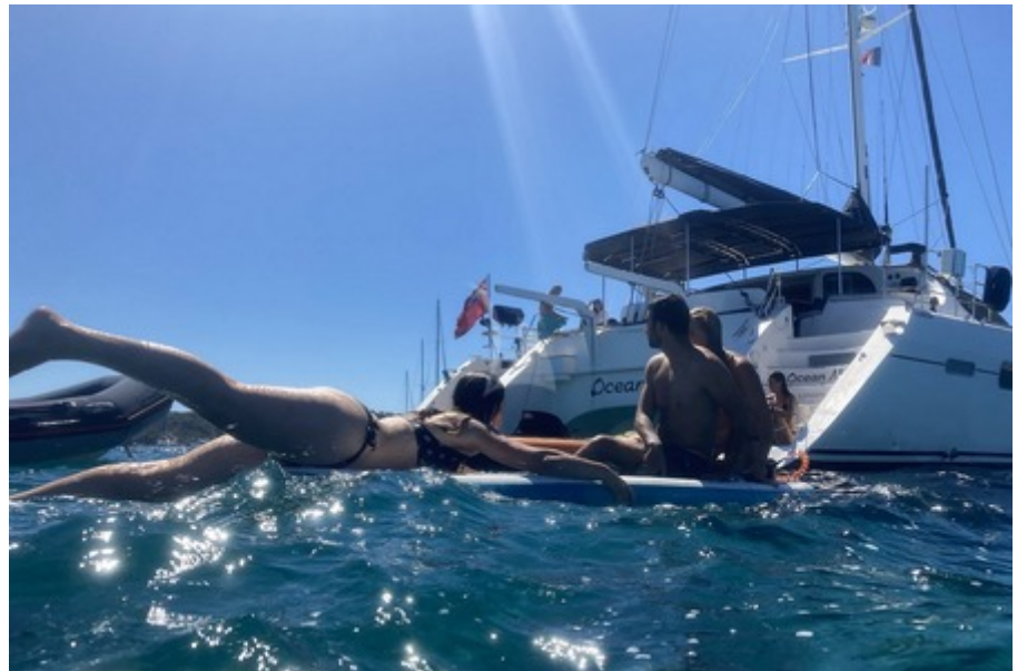
Time for fun