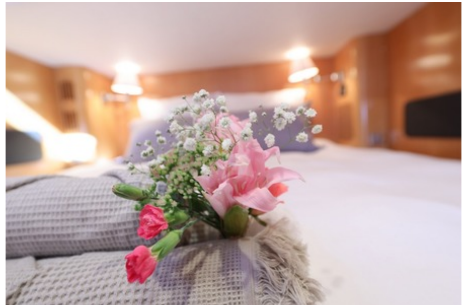
Guest cabin