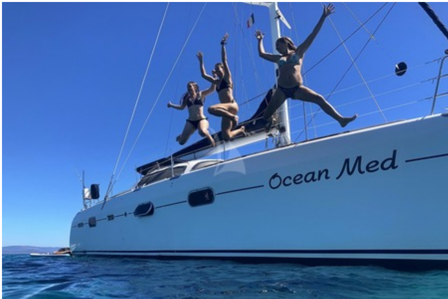
Time for fun