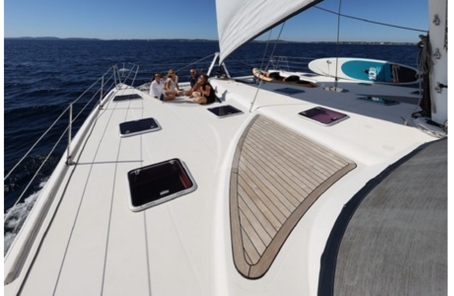
On deck