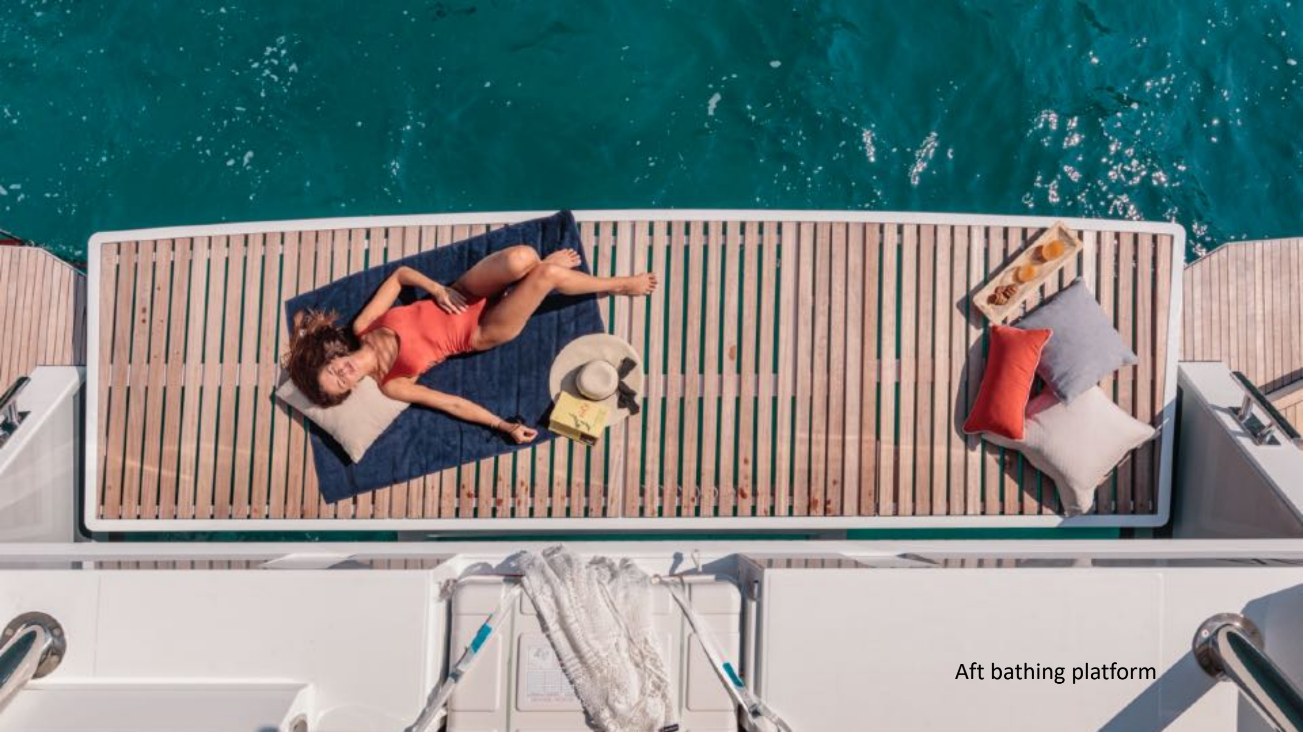
Aft bathing platform