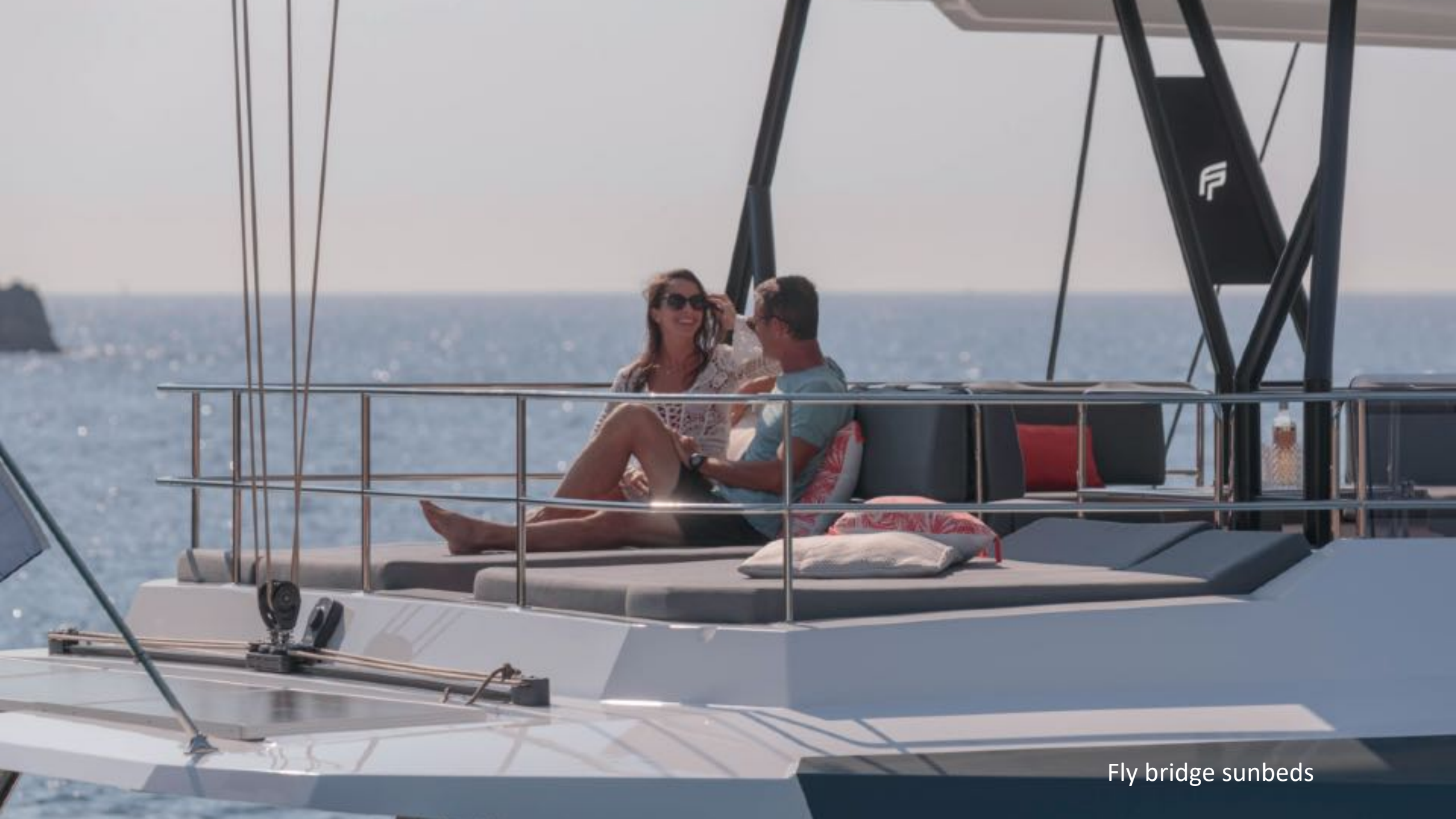
Fly bridge sunbeds