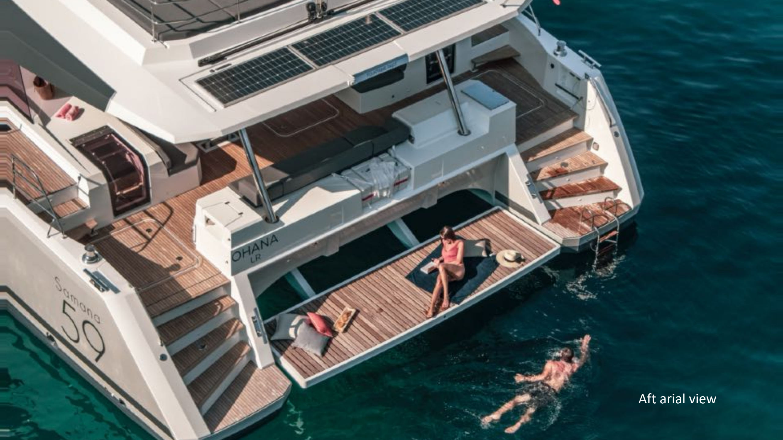
Aft arial view