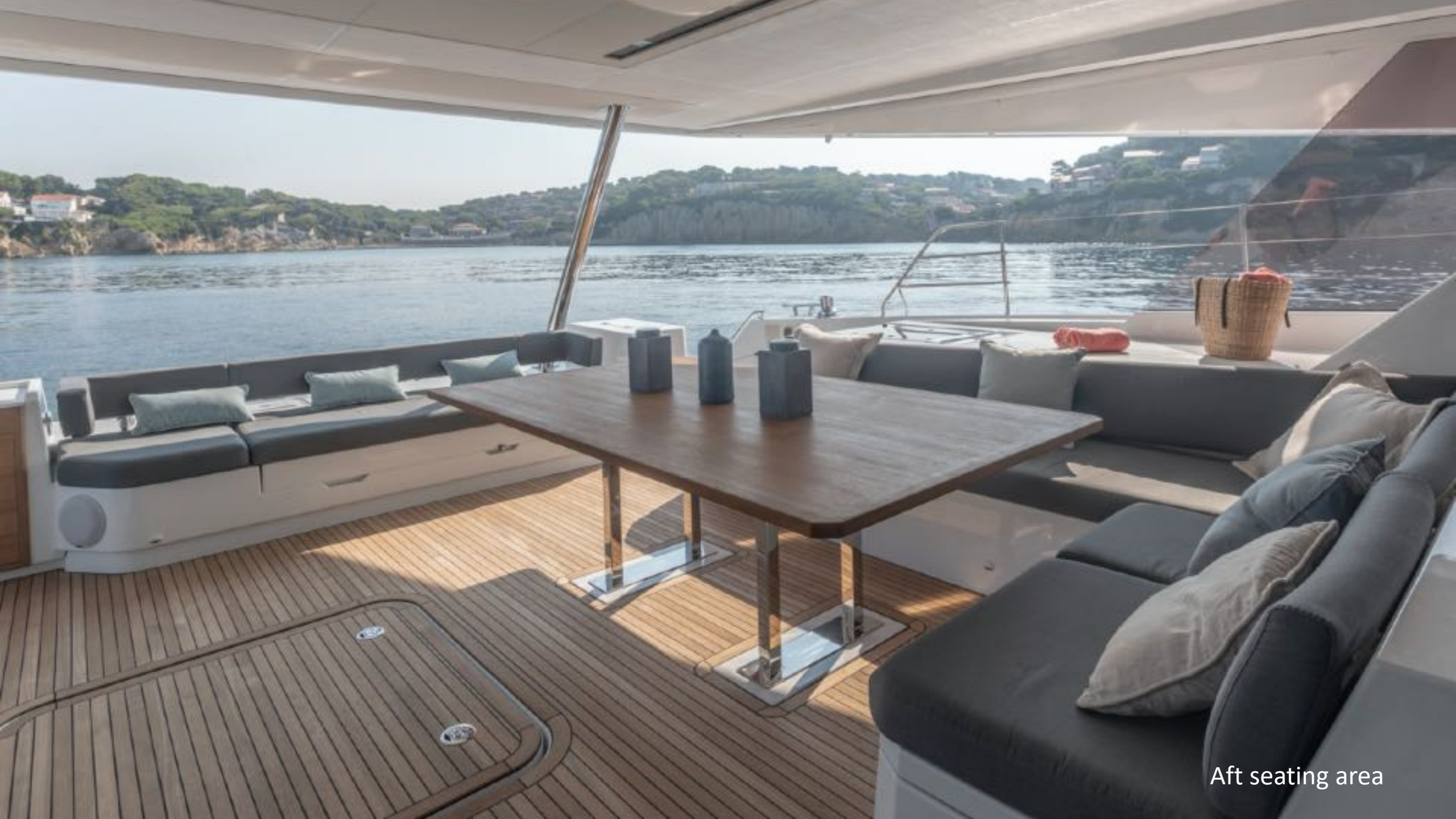
Aft seating area