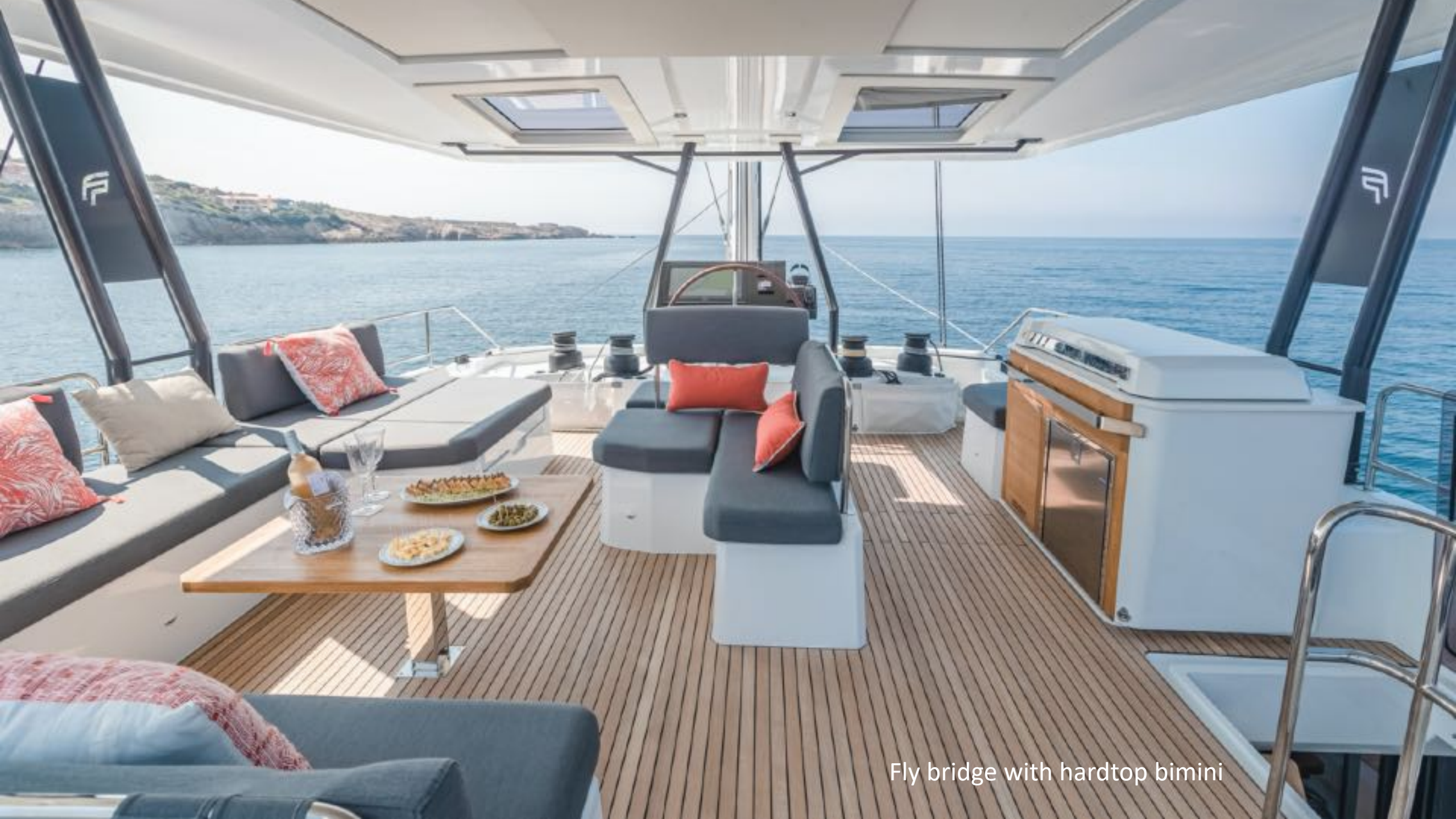
Fly bridge with hardtop bimini