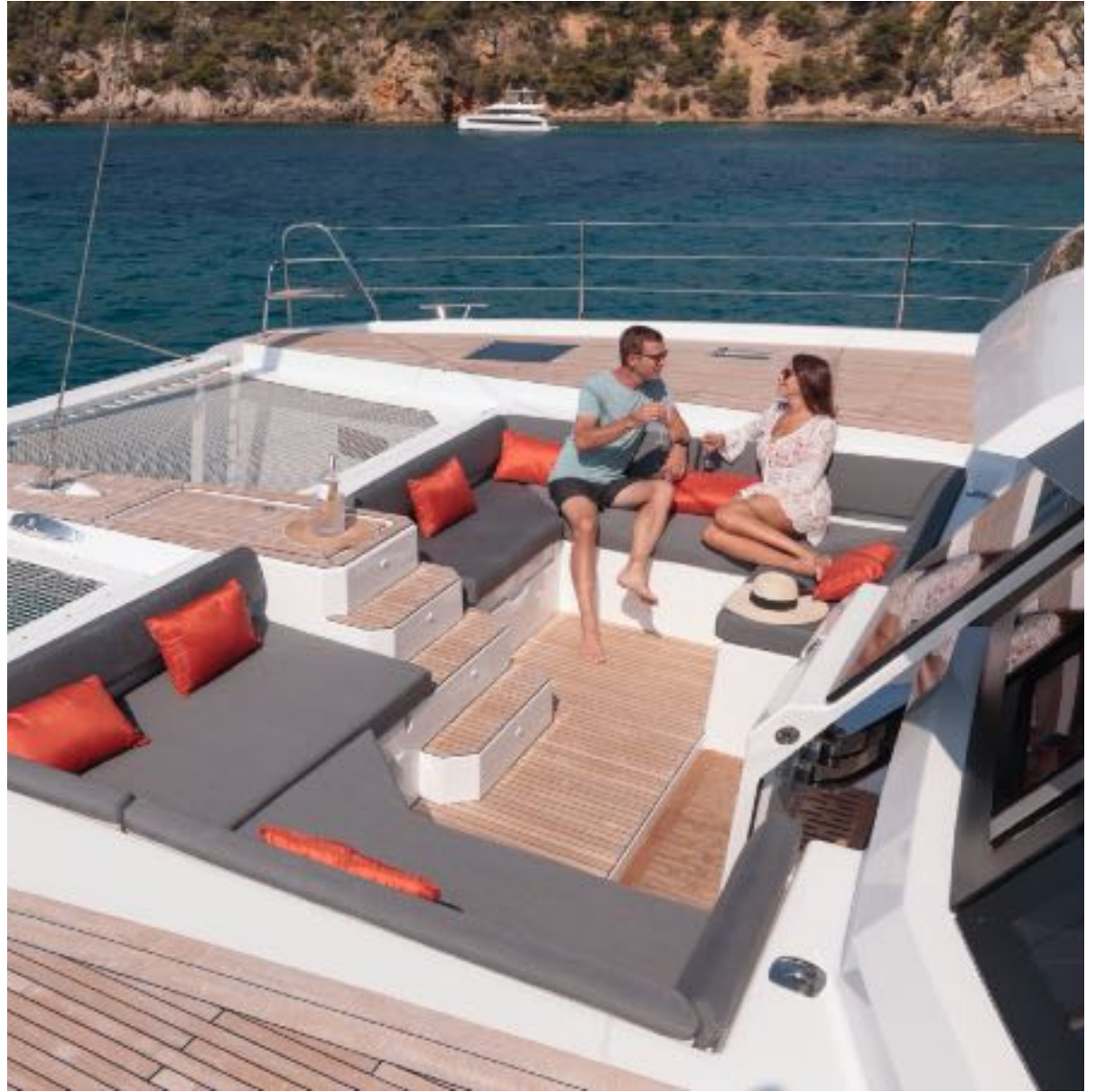
Fore deck seating area