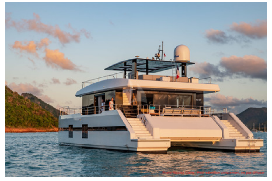
Nicolas Claris picture