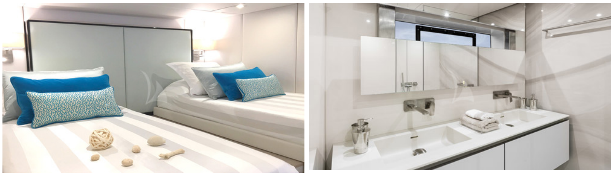
Double cabin converted in twin