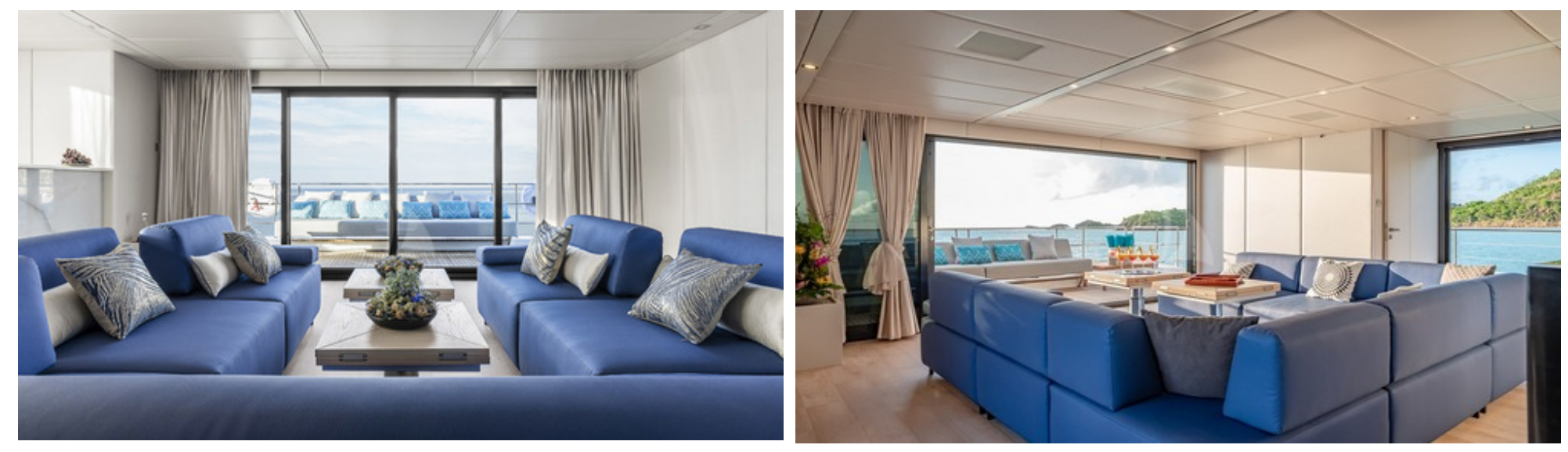
Saloon other view