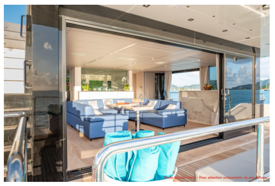
Nicolas Claris picture