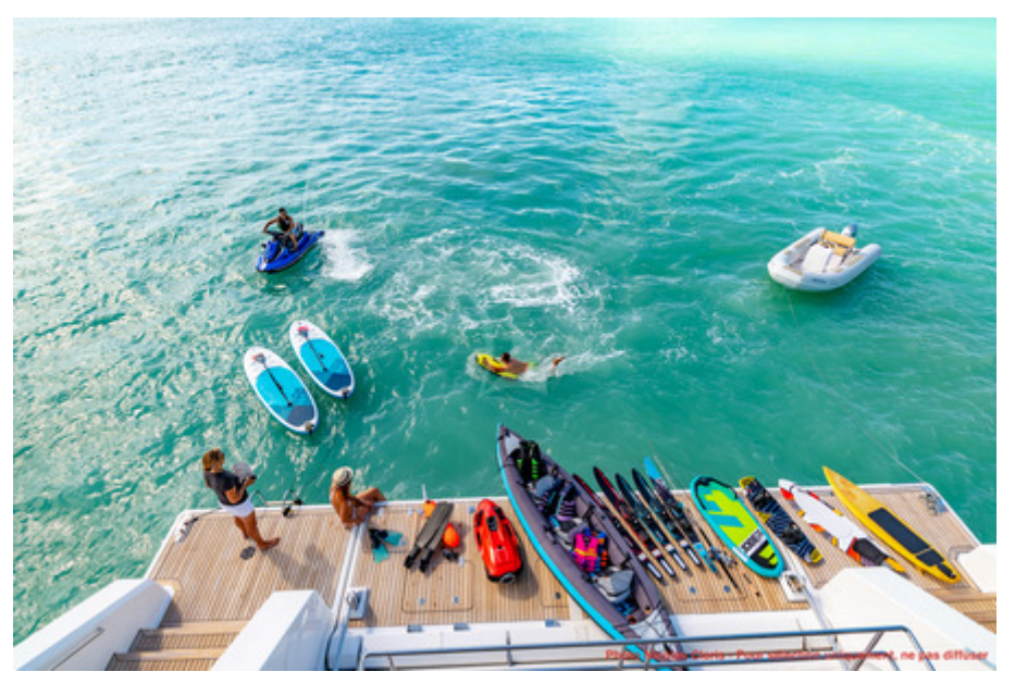
Nicolas Claris picture