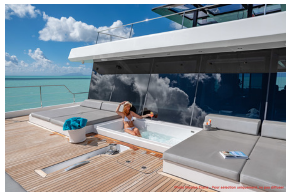
Nicolas Claris picture