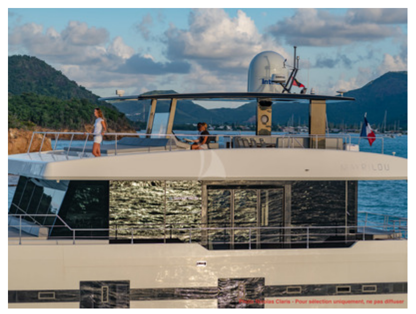
Nicolas Claris picture