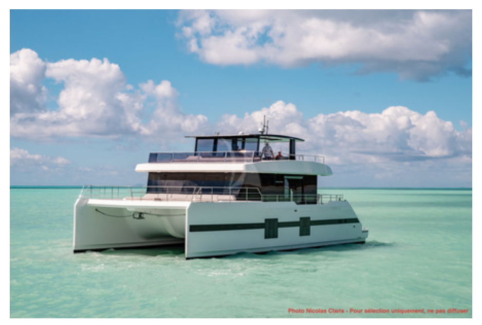
Nicolas Claris picture